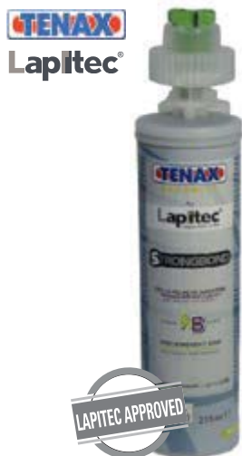
Stock No. Description 709915 .....Dispenser