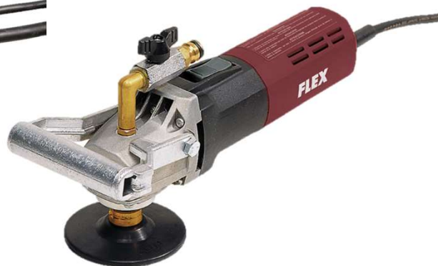
LW 1503 A

All FLEX WET grinders and polishers are equipped with a ground fault circuit interrupter ( GFCI ) to ensure safe operation in wet environments.