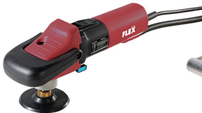
LE 12-3-100 WET 120/USA